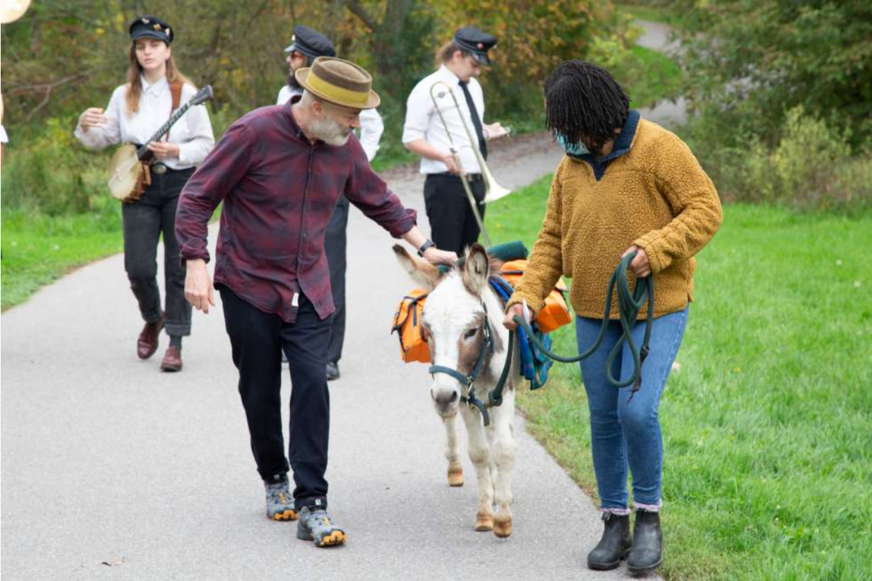
The Salt, the Donkey, the Goat, the Milk, the Brass Band 2021