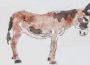
ZAMORANO - LEONES